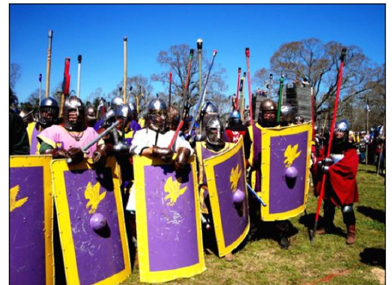
Calontir Army at Gulf Wars