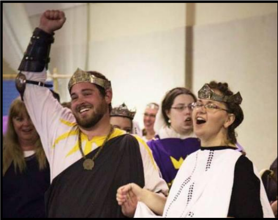
THEIR ROYAL HIGHNESSES © 2014 KATE GILL