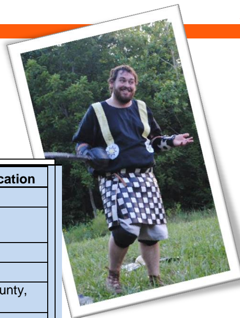
HRH Agememnon