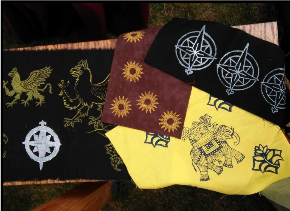
Stamping from Known World Fiber Symposium