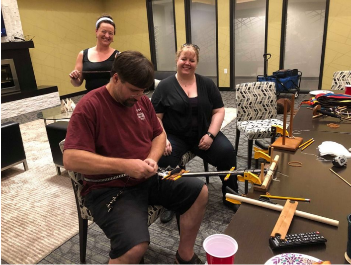
A&S Gathering, Coeur d'Ennu