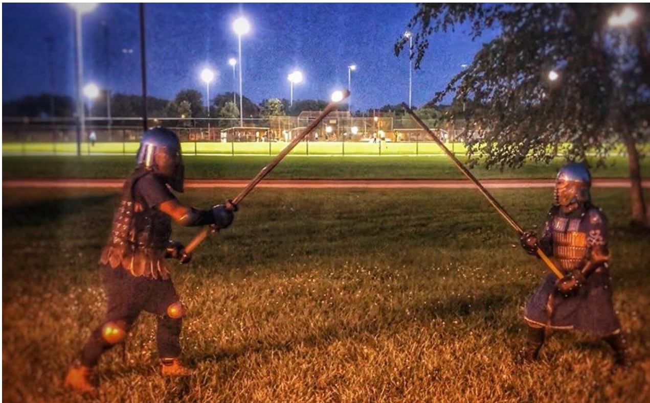
Fighter Practice, Coeur d'Ennu